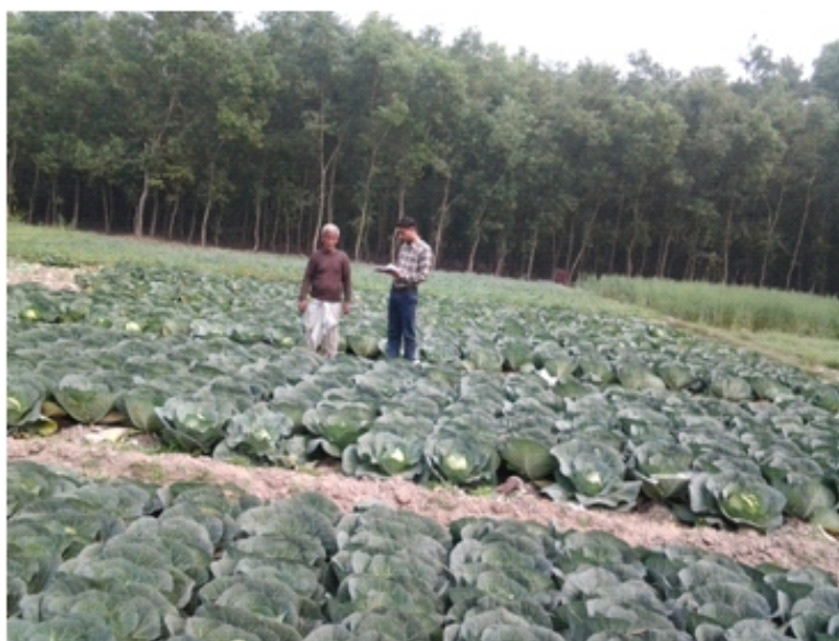
Agricultural Expert giving suggestion in Dakshin Dinajpur

Formed 83 WUA, with total more or less 19820 benefited farmers, covering 8 blocks and 65 village. Conducted 48 WUA trainings on agriculture and horticulture based sustainable livelihood development and 1443 persons are trained. Total 83 Schemes are already handed over and being managed by the WUAs.