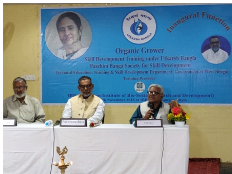
Inauguration of the programme

Conducted training on Organic Growers at IBRAD campus, Kolkata on residential mode. There were 23 farmers from Bankura and North 24 parganas who received the from 20 th November to 31 st December 2018.