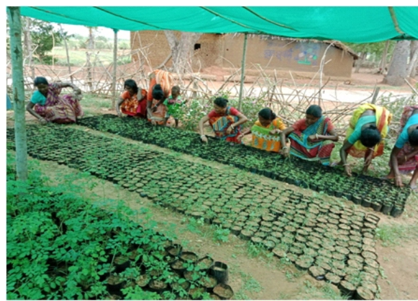
Community and nursery and kitchen garden at Jhargram and Bankura