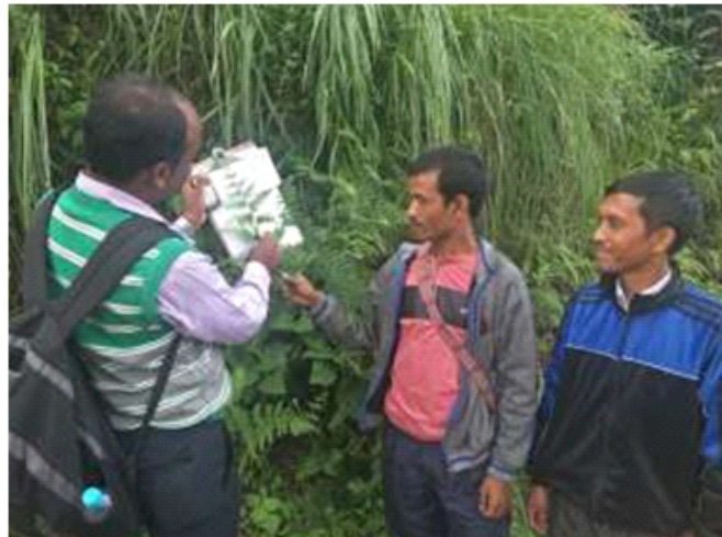
Facilitation to preparation of PBR to the villages