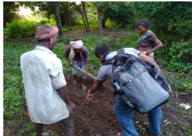
Initiation of Kitchen Gardens by the Community