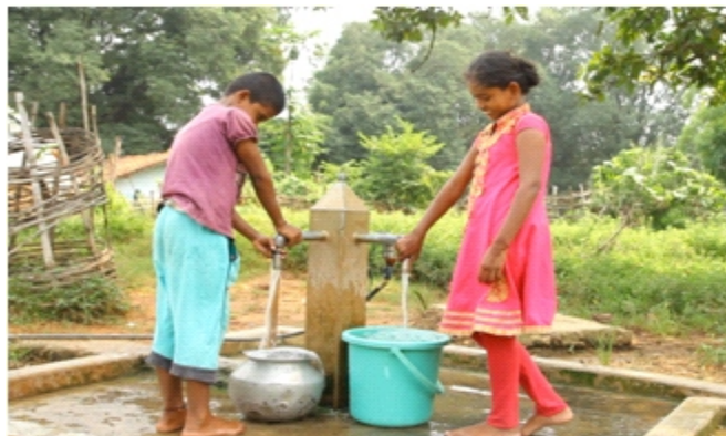
Interventions made by CREDA in Chhattisgarh State