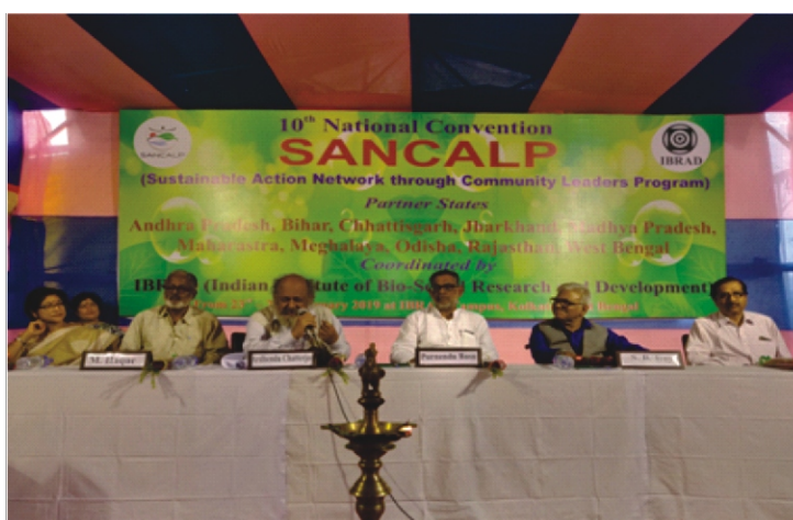
Inauguration of SANCALP 2019 at IBRAD Campus

Ten states are participating in the program namely Bihar, Jharkhand, Odisha, Chhattisgarh, Madhya Pradesh, Maharashtra, Rajasthan, Meghalaya, Tripura and West Bengal.