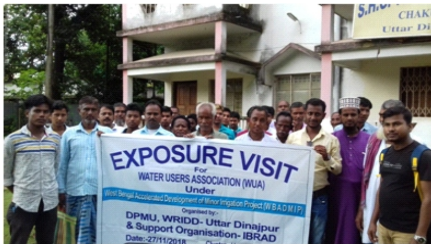
Exposure visit for Water Users Association (WUA) in Uttar Dinajpur

Formed 47 WUA with total 4330 members covering 9 blocks and 47 villages. Conducted 48 trainings on agriculture and horticulture based sustainable livelihood development and 1440 persons are trained. 47 Schemes are already handed over and being managed by the WUAs.