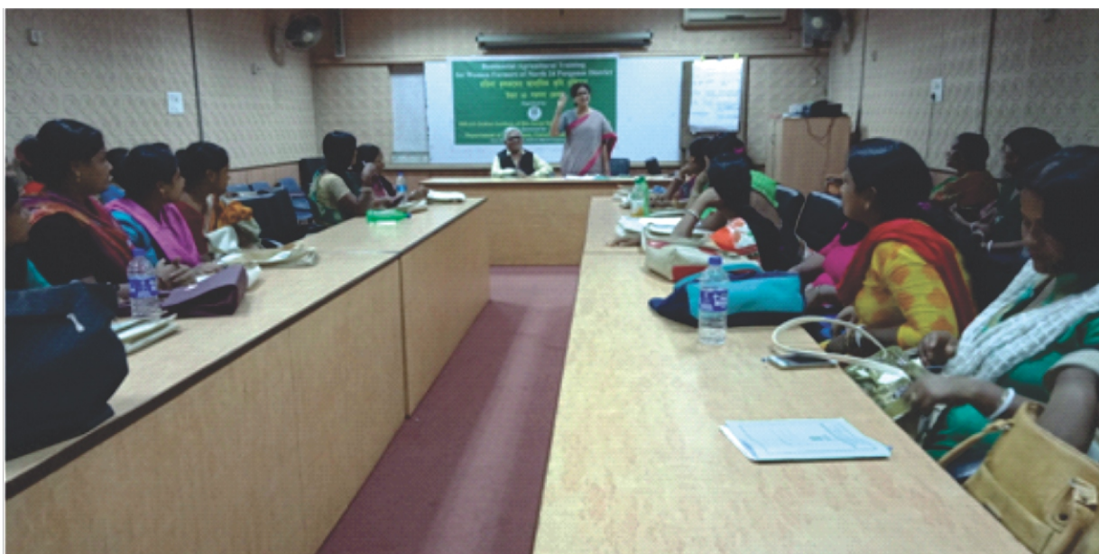
Inauguration of the training programme

A residential agricultural training for women farmers of North 24 Parganas district of West Bengal was organized by IBRAD sponsored by Deputy Director of Agriculture (Admin) North 24 Parganas for the women farmers of North 24 PGS from 23 rd to 27 th July, 2018 at IBRAD campus, Kolkata. There were 30 women farmers from Barasat- Barrackpore, Basirhat and Bongaon who have participated in the training.