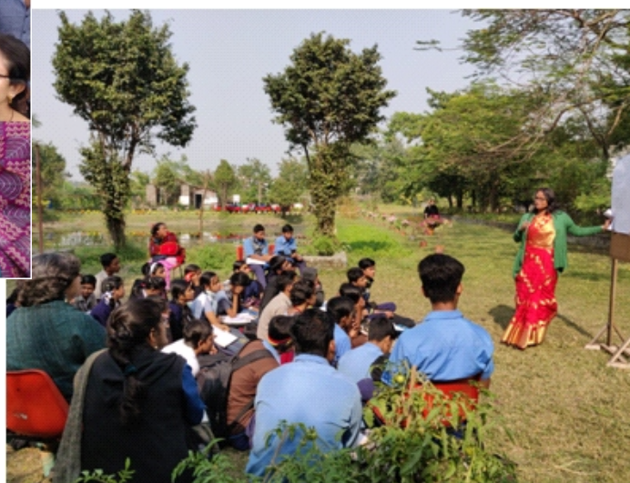
Students and teachers Participation during the winter school