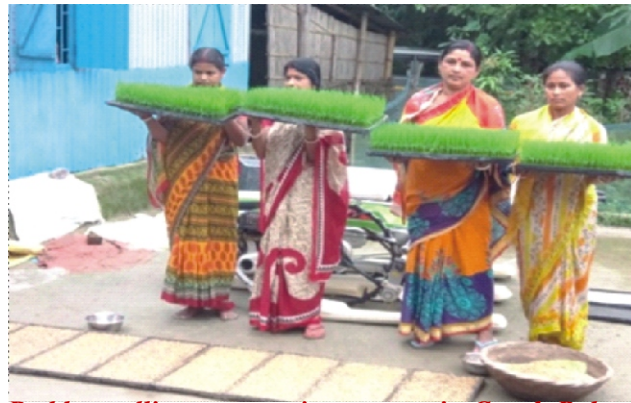
Paddy seedling preparation on tray in Cooch Behar

Formed 124 WUA, with total 5997 members, covering 11 blocks and 86 villages. Conducted 95 trainings on Institution building, 110 training on agriculture and horticulture based sustainable livelihood development, 20 training on fishery and 10,787 persons are trained, facilitated information of 2351 demonstration sites for horticulture and Agriculture DCS 47 Schemes are already handed over and being managed by the WUAs.