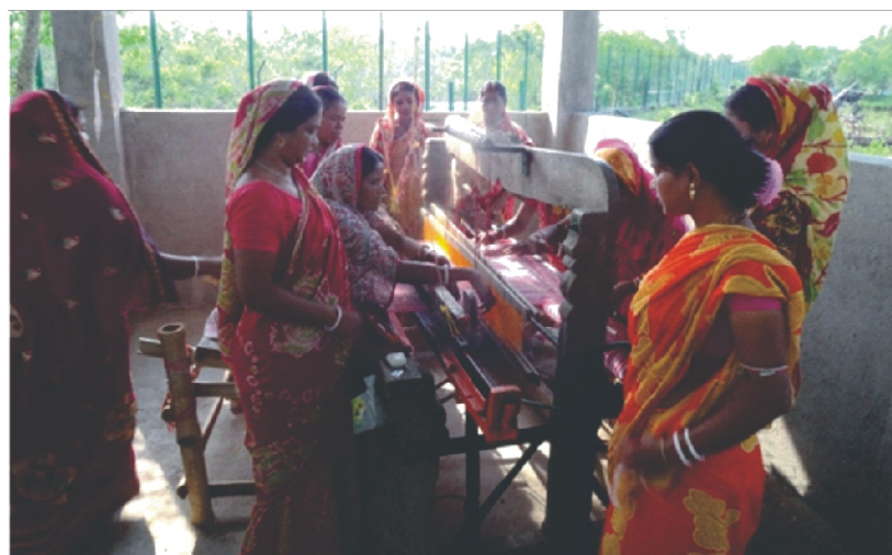
Interventions made by Forest Department at Sundarban Tiger Reserve

The study was conducted covering 14 JFMCs and 21 SHGs in the National Park West, Sajnekhali and Basirhat ranges. IBRAD completed the study and prepared a report that was accepted by the client.