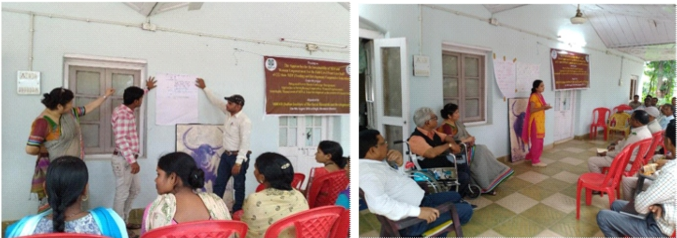
Training of the Cooperative members at Dugli

Objective: Initiated the study, Conducted baseline Study and training of the staff and community.