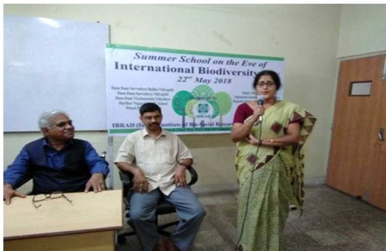
Teacher of the school presenting their experiences

On the Eve of International Biodiversity Day, 22 nd May 2019, IBRAD organized a workshop for the school students at IBRAD Campus, Kolkata. In this workshop 53 students and teachers from 7 schools were participated.