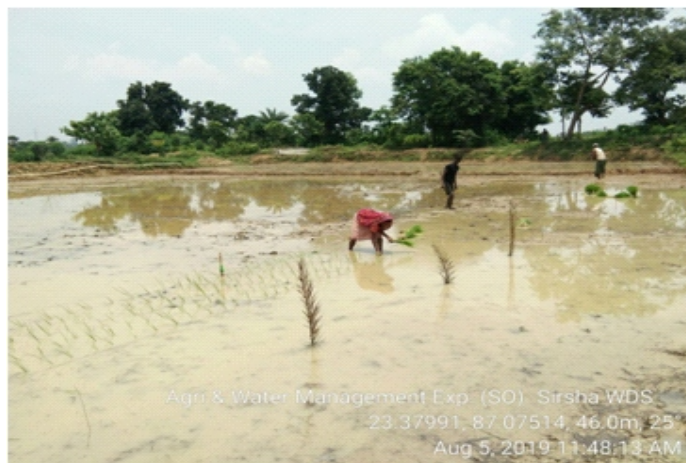
Paddy line sowing in Bankura