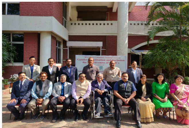
IFS officers from nine states participated in the IFS officers training from 7 th – 11 th January 2019

A training workshop on “Gender sensitization and inclusion for effectiveness of the JFMCs” sponsored by Ministry of Environment, Forest and Climate Change was organized for the Indian Forest Service Officials from 7 th to 11 th January 2019 at IBRAD campus, Kolkata. There were officials from the states Assam, Maharashtra, Gujarat, Madhya Pradesh, Uttar Pradesh, Karnataka, Nagaland, Kerala and Rajasthan have participated in the workshop.