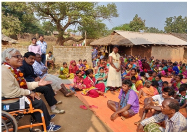
Capacity Building of the forest fringe villages including Juang tribes and forest officials

Outcomes : Conducted baseline study – Designed and conducted trainings for the forest officials and staff, awareness and Capacity Building of the forest fringe villages including Juang tribes, a PVTG for sustainable livelihood development.