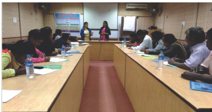
Janamangal members attending orientation programme

A residential Organic Farming training was organized by IBRAD on 30 th to 31 st January 2019 at IBRAD campus, Kolkata. In the training program 19 participants from Janamangal Organisation, Odisha participated.